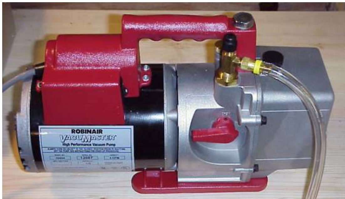
Figure 2, the vacuum pump (typical model shown).

The vacuum pump is shipped dry and must be filled prior to first use. With the power off, remove the black plastic fill plug on the top of the vacuum pump. Using a funnel, pour in just sufficient oil to bring the level up to the indicated line on the sight glass (approx. 400ml). Do not overfill. If too much oil is added, drain some by opening the drain plug on the bottom of the pump. Run the pump for a few minutes, turn off and recheck the level.